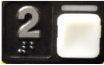
Schindler MTA-Style Button