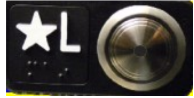
MEI Vandal-Proof Button